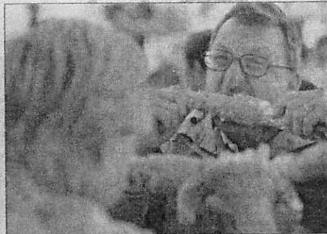
THE WASHINGTON POST

ARLINGTON COUNTY FAIR Friday 2 to 11, Saturday 10 to 9 and Sunday 11 to 10. Who has the best-preserved honey in all of Arlington County? It's not a question that's usually asked of Northern Virginia, but it's one that will be answered at the Arlington County Fair. Competitive exhibits, like honey, bees wax and food preservation, best herbs and